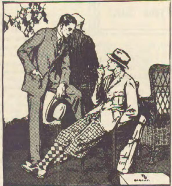
Copyright 1924 Hart Schaffner & Marx

What we can't understand is why an executive needs an assistant when there is no decent golf weather.—Ex.